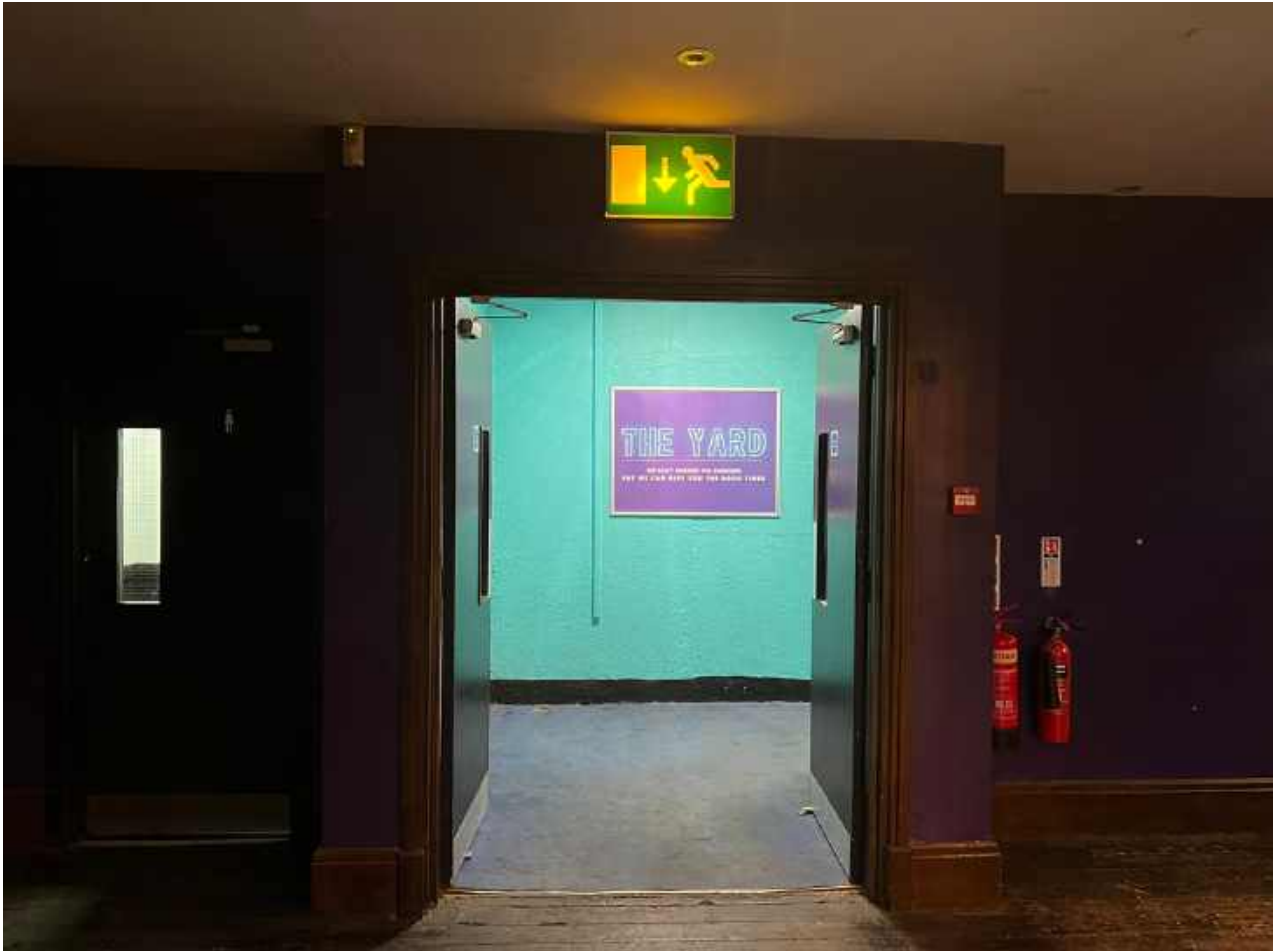
Image description: exit passage to the Yard from Screen 1 and the bar.