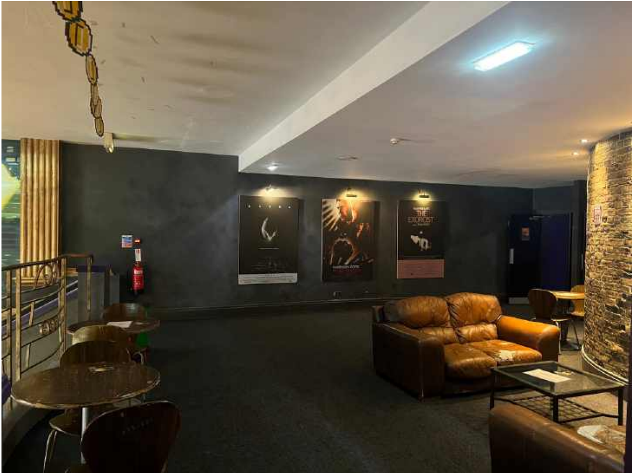
Image description: view of the mezzanine from the right hand side main staircase.