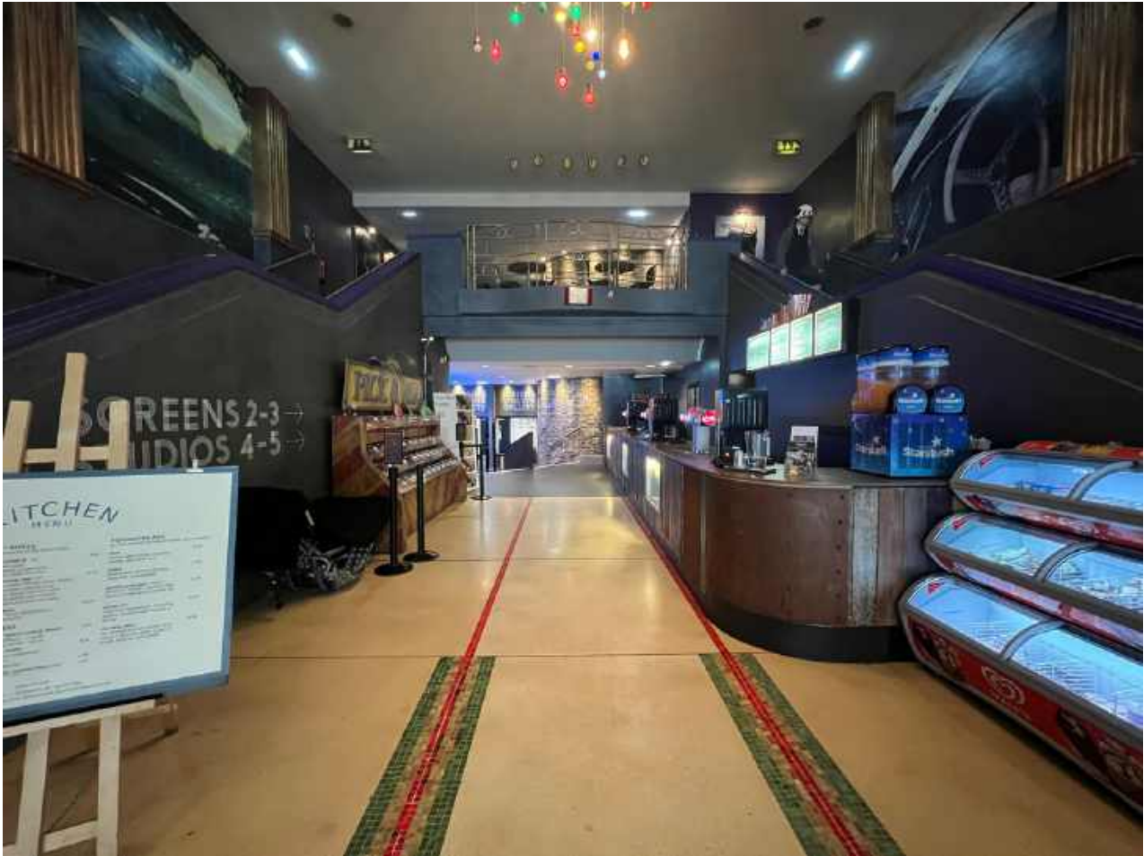
Image description: side view of the kiosk. You can see both our staircases on the left and right hand side of the image.