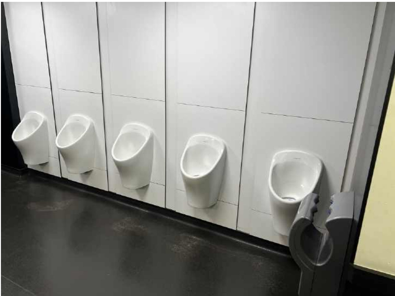
Image description: urinals and hand dryer in the upstairs male toilets.