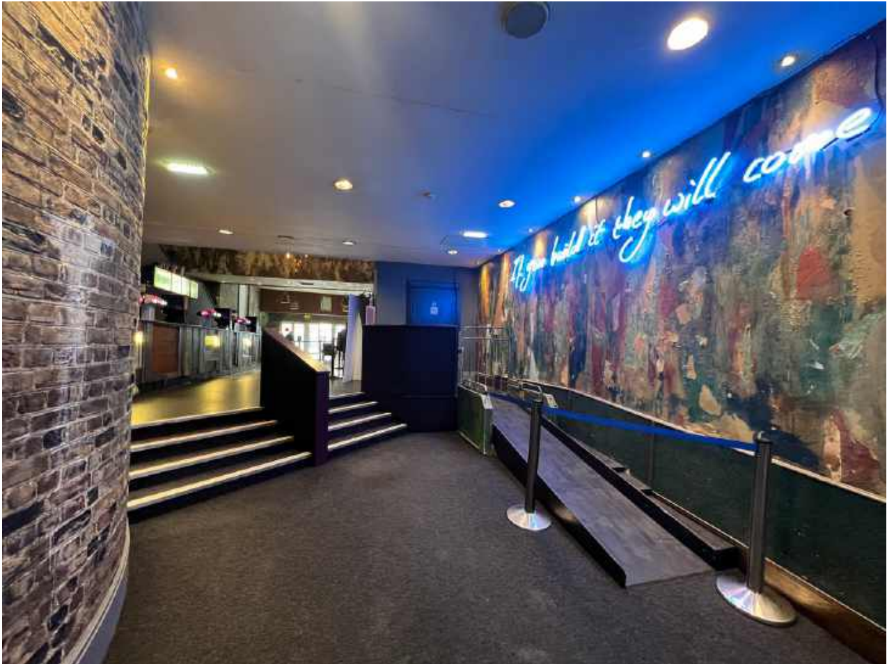
Image description: the hallway between the kiosk and the gallery, with four (4) steps and one (1) ramp. This is a well-lit area with a blue neon light on one of the walls.