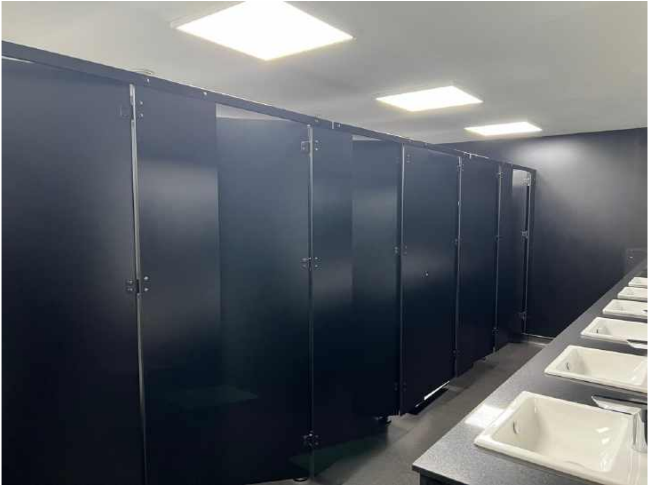
Image description: cubicles' doors in the upstairs female toilets.