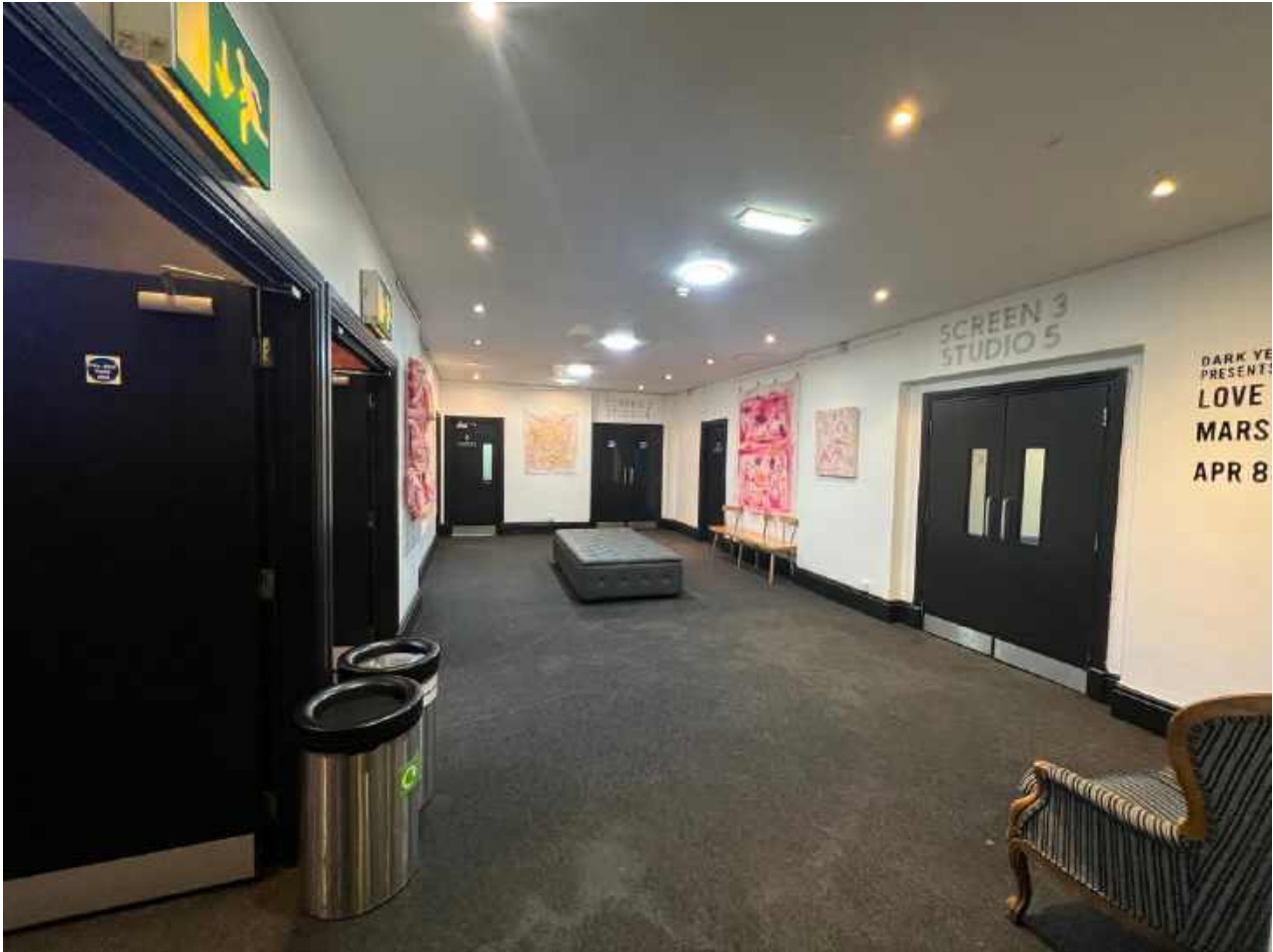
Image description: the gallery, from which you can see a door leading to Screen 2 and Studio 4, and another door leading to Screen 3 and Studio 5.