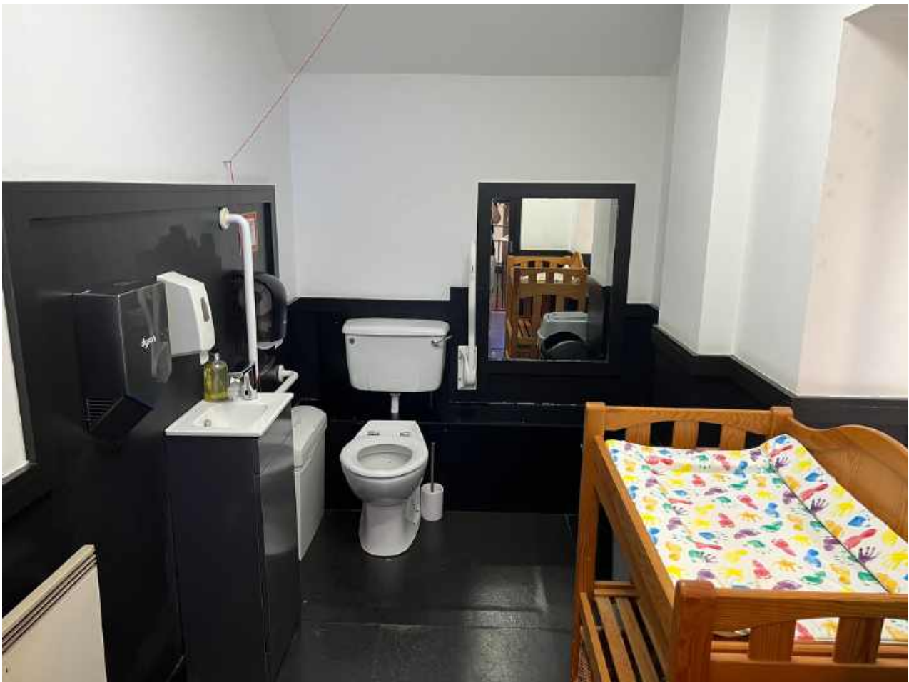
Image description: our disabled, gender inclusive toilet with baby changing facilities.