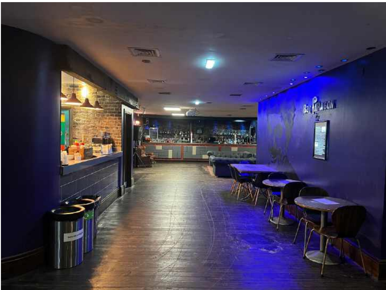
Image description: view of the Kitchen (left hand side) and Bar Paragon in the background.