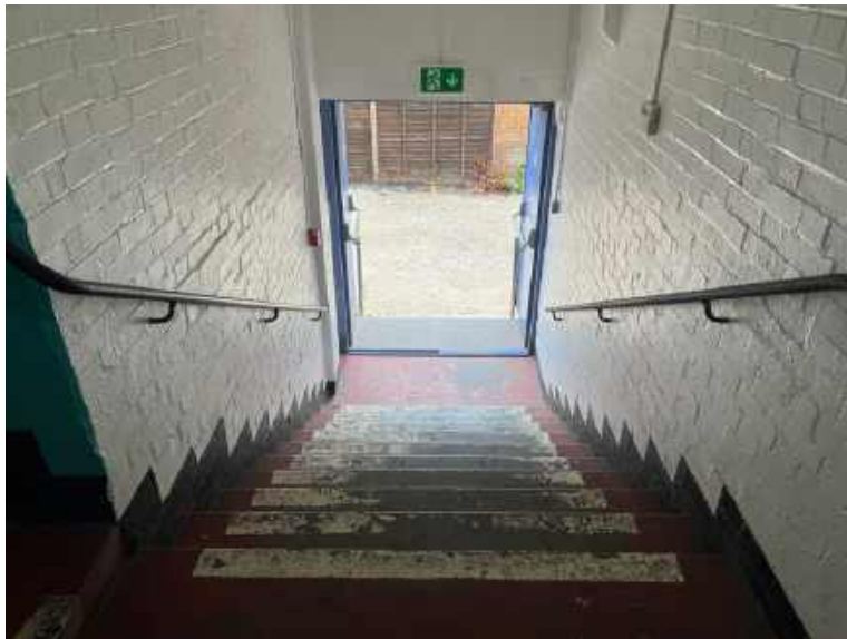
Image description: Staircase leading to the Yard from Screen 1 and the bar.