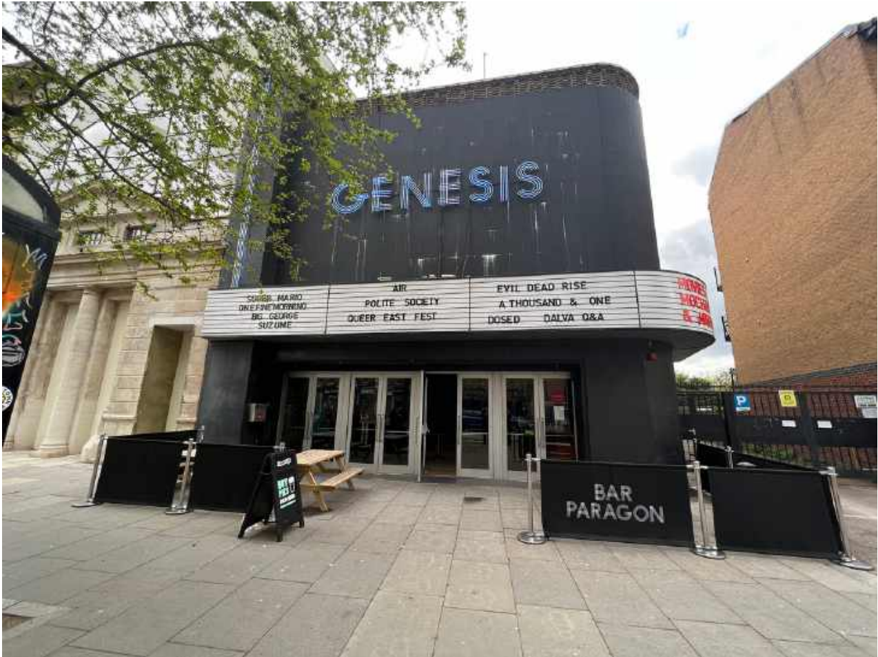
Image description: entrance to Genesis Cinema from the street on Mile End Road.