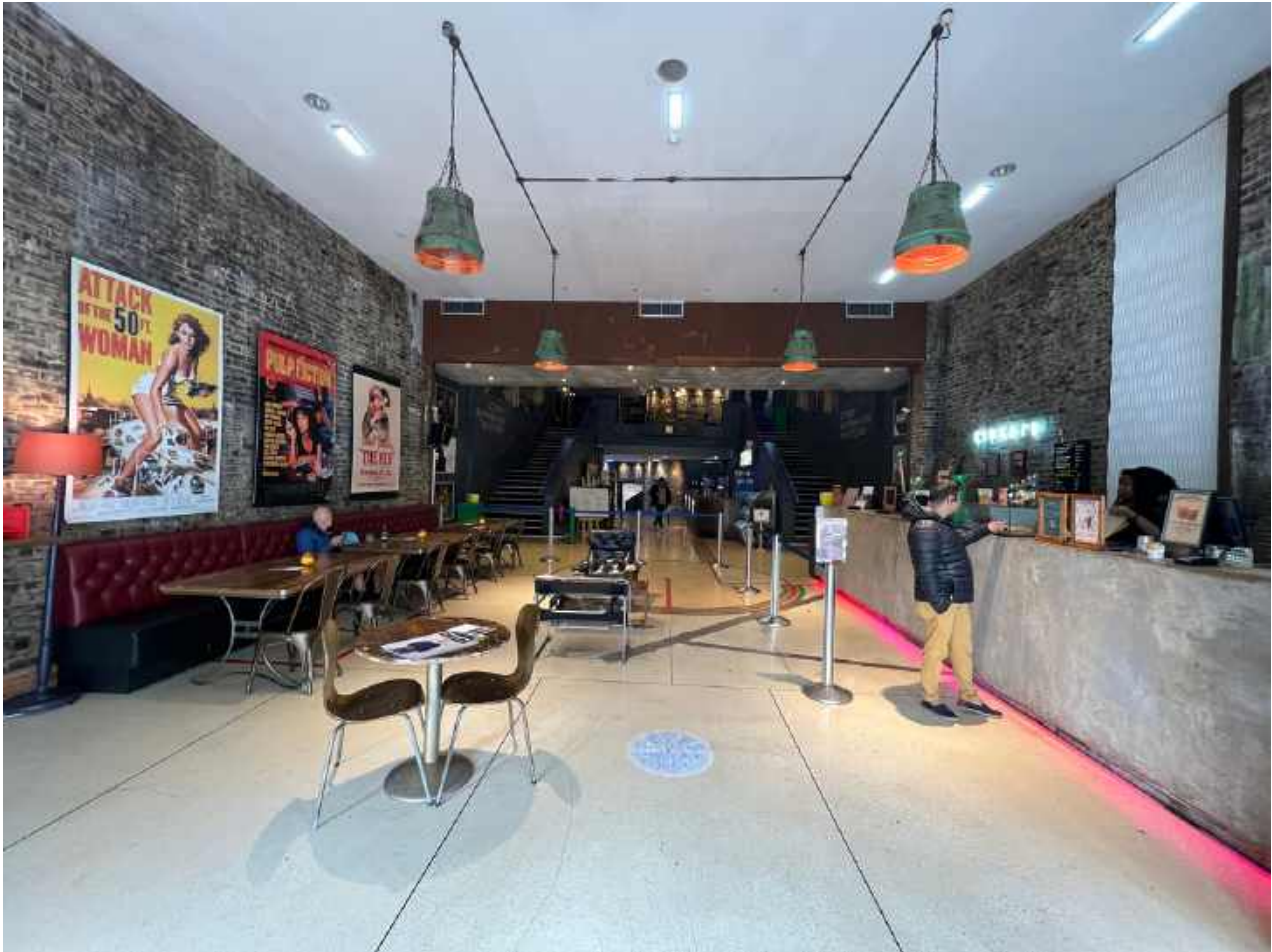
Image description: the foyer. There are three long tables on the left hand side, a small round table with chairs and two armchairs in the middle, and the box office on the right hand side.