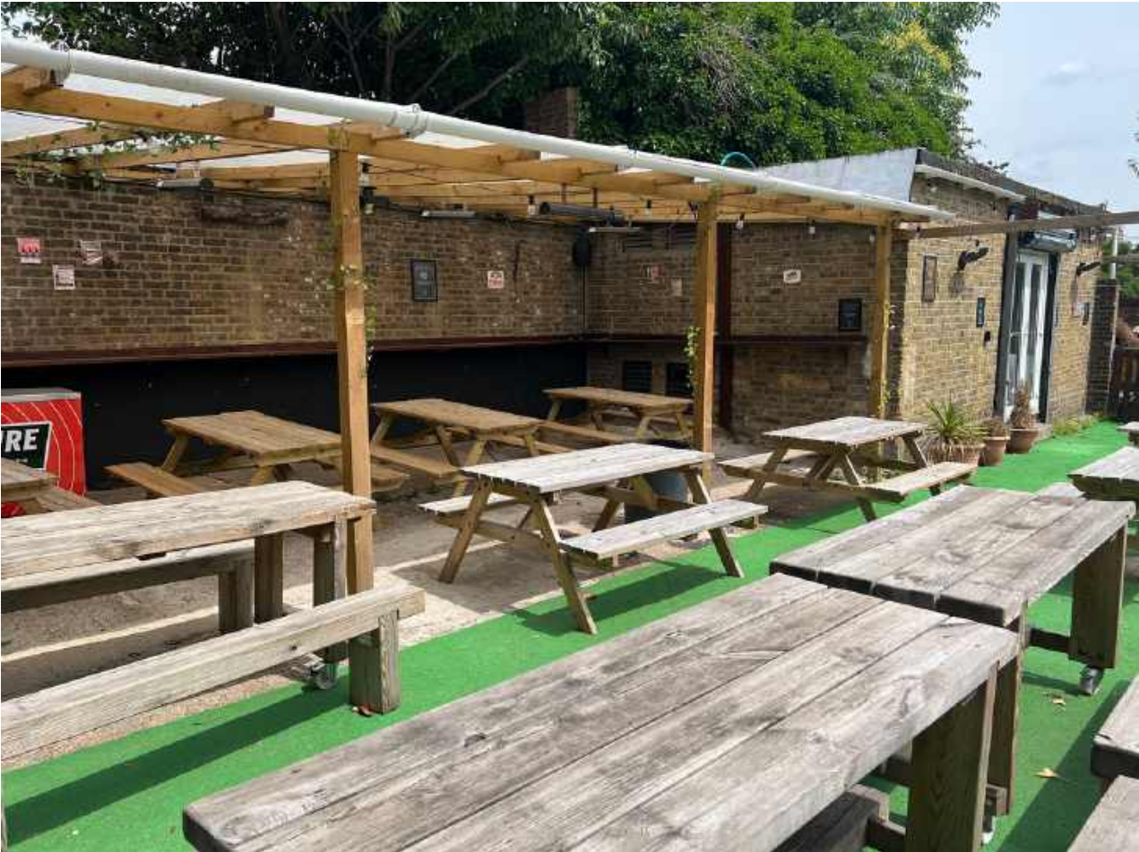
Image description: the Yard's layout with wooden tables and benches.